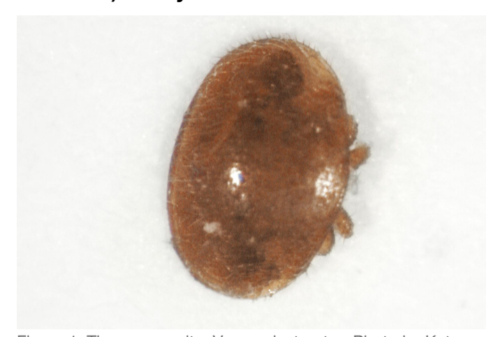
Figure 1. The varroa mite, Varroa destructor.

Varroa mites (Varroa destructor), are the most influential of all of the pests and diseases of the European honey bee (Apis mellifera) today.