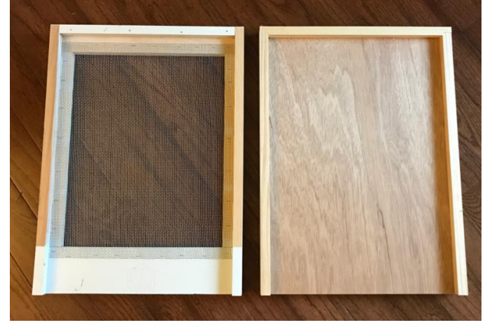
Figure 5. The bottom board on the left is a screened bottom board, whereas the one on the right is a solid bottom board. The floor of the hive can be screened to allow varroa mites to fall through to the ground, where they cannot return to the colony. Image by Robyn Underwood.

Mites naturally fall off of bees as a result of movement within the colony and honey bee grooming behavior. If a screened bottom board, rather than solid wood one is used (Figure 5), mites fall onto the ground and are less likely to climb back onto the bees. Screened bottom boards decrease mite invasion into brood cells, resulting in a lower percentage of the population being found in the brood reproducing. Mite loads often still reach economic thresholds in hives with screened bottom boards, so this physical method to control varroa mites must be used in combination with other control techniques.