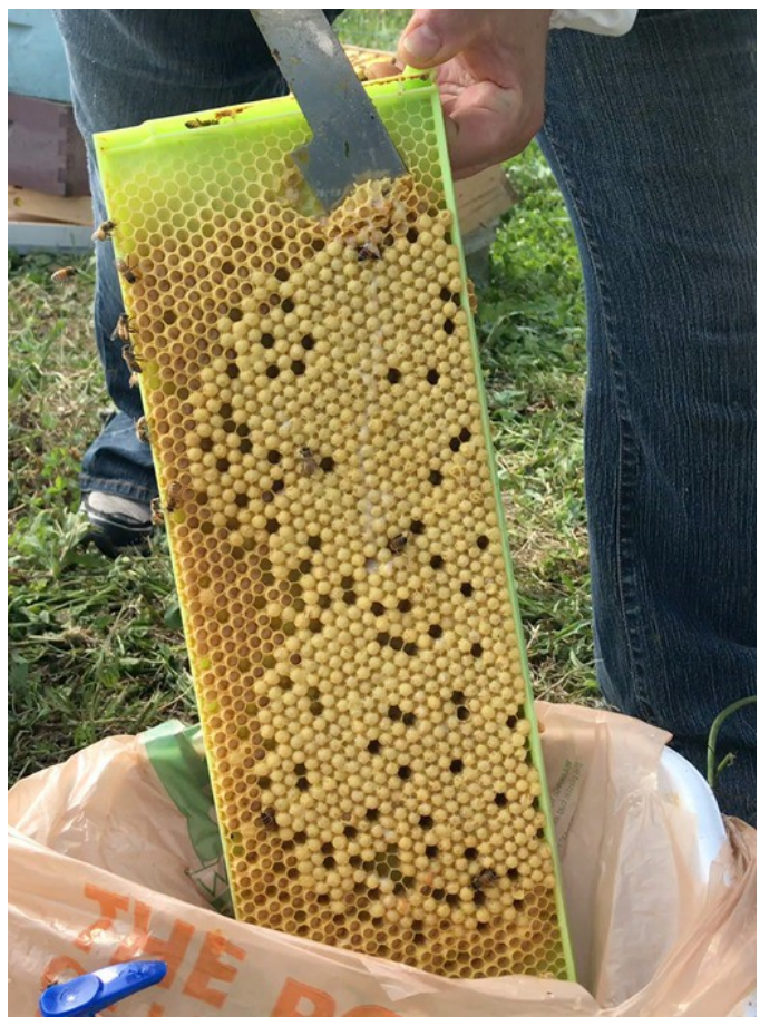
Figure 4. Scraping drone brood from a frame that was added to act as a mite trap.

Drone brood removal takes advantage of the mites' preference for drone brood for reproduction, using them as a trap. Varroa mites have higher reproductive success in drone brood than in worker brood due to the post-capping period allowing mites to produce only 1.3-1.4 offspring per attempt in worker cells, but 2.2-2.6 offspring in drone cells (Figure 2). In addition, the period of attractiveness of drone brood is 40-50 hours, as opposed to only 15-30 hours in worker brood. Together, these reproductive advantages of drone brood manifest as a 6-fold increase in mites found under the cappings of drone cells than under worker cells. Adding drone comb to a colony encourages drone production that acts as a trap for mites. Removing that comb prior to drone emergence effectively removes the varroa mites reproducing in the cells. The drone brood can then be frozen and returned to the colony or scraped off of the frame (Figure 4). This practice reduces mite reproduction, which prolongs the length of time before the population reaches the threshold. However, it may not be effective enough to act as the only means for controlling varroa mites.