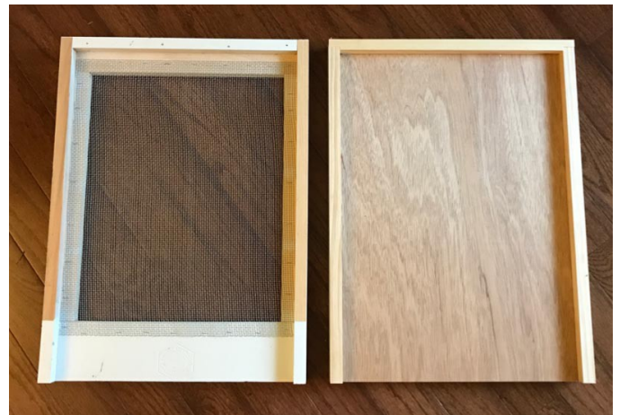
Figure 5. The bottom board on the left is a screened bottom board, whereas the one on the right is a solid bottom board. The floor of the hive can be screened to allow varroa mites to fall through to the ground, where they cannot return to the colony.

Mites naturally fall off of bees as a result of movement within the colony and honey bee grooming behavior. If a screened bottom board, rather than solid wood one is used (Figure 5), mites fall onto the ground and are less likely to climb back onto the bees. Screened bottom boards decrease mite invasion into brood cells, resulting in a lower percentage of the population being found in the brood reproducing. Mite loads often still reach economic thresholds in hives with screened bottom boards, so this physical method to control varroa mites must be used in combination with other control techniques.