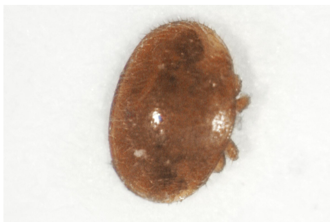
Figure 1. The varroa mite, Varroa destructor .

Varroa mites ( Varroa destructor ), are the most influential of all of the pests and diseases of the European honey bee ( Apis mellifera ) today.