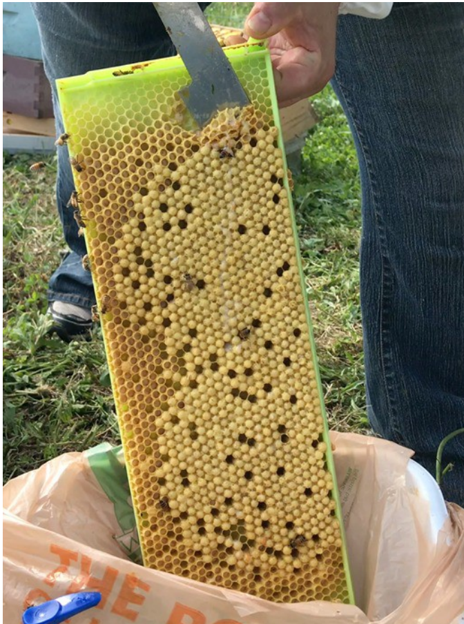
Figure 4. Scraping drone brood from a frame that was added to act as a mite trap.

Drone brood removal takes advantage of the mites' preference for drone brood for reproduction, using them as a trap. Varroa mites have higher reproductive success in drone brood than in worker brood due to the post-capping period allowing mites to produce only 1.3-1.4 offspring per attempt in worker cells, but 2.2-2.6 offspring in drone cells (Figure 2). In addition, the period of attractiveness of drone brood is 40-50 hours, as opposed to only 15-30 hours in worker brood. Together, these reproductive advantages of drone brood manifest as a 6-fold increase in mites found under the cappings of drone cells than under worker cells. Adding drone comb to a colony encourages drone production that acts as a trap for mites. Removing that comb prior to drone emergence effectively removes the varroa mites reproducing in the cells. The drone brood can then be frozen and returned to the colony or scraped off of the frame (Figure 4). This practice reduces mite reproduction, which prolongs the length of time before the population reaches the threshold. However, it may not be effective enough to act as the only means for controlling varroa mites.